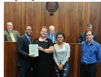
Oak Ridge City Council Proclamation

Red Ribbon Week is a national alcohol, tobacco, and other drug and violence prevention awareness campaign observed for one week each October. ASAP of Anderson had events throughout the week in accordance with the mission of the campaign which included: local Red Ribbon proclamations from city and town councils, Drug Take Back events in partnership with Clinton, Norris, Oak Ridge, and Rocky Top Police Departments, and also the Red Ribbon Rivalry fundraising and awareness campaign between Anderson County, Clinton, and Oak Ridge High Schools.