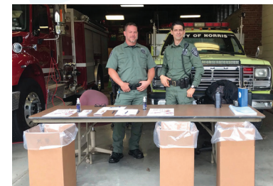
Norris Police Department on DEA Take Back Day