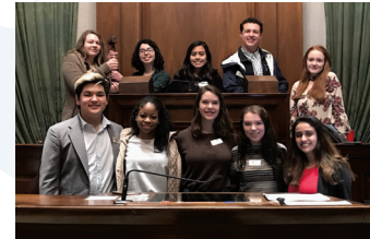
Youth Ambassadors in the Senate Hearing Room at the State Capitol

In Late February, ASAP continued their month of advocacy in Nashville, TN with state legislators. Coalition members, staff, and youth ambassadors joined coalitions across the state for Prevention Alliance of Tennessee (PAT) Day on the Hill.