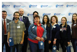
Coalition members receiving their Volunteer Hour Awards