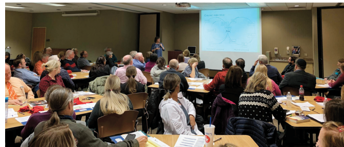
Behavioral Aspects of Pain Management Training at Methodist Medical Center, March 5th

ASAP continues to work closely with health professionals to advocate for prevention in the healthcare field.