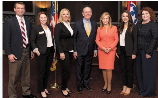
Coalition Members and Staff with Senators Alexander and Blackburn

In early February, coalition members and staff travelled to Washington D.C. to join over 2,800 substance misuse prevention specialists and advocates from across the country for CADCA's 29 th Annual Leadership Forum.